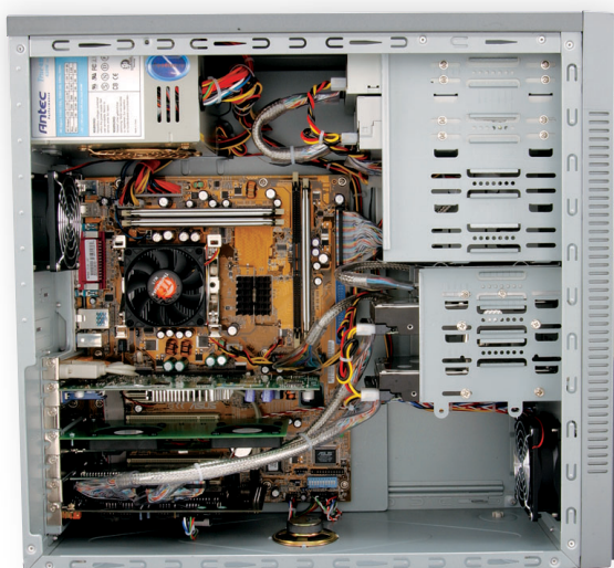
Top-notch performance and a wired-tight interior make the ProMagix a winner.

We don't know whether it's the PC1066 memory, the RAIDed hard drives, or the Asus motherboard's aggressive memory timings. But we can say that